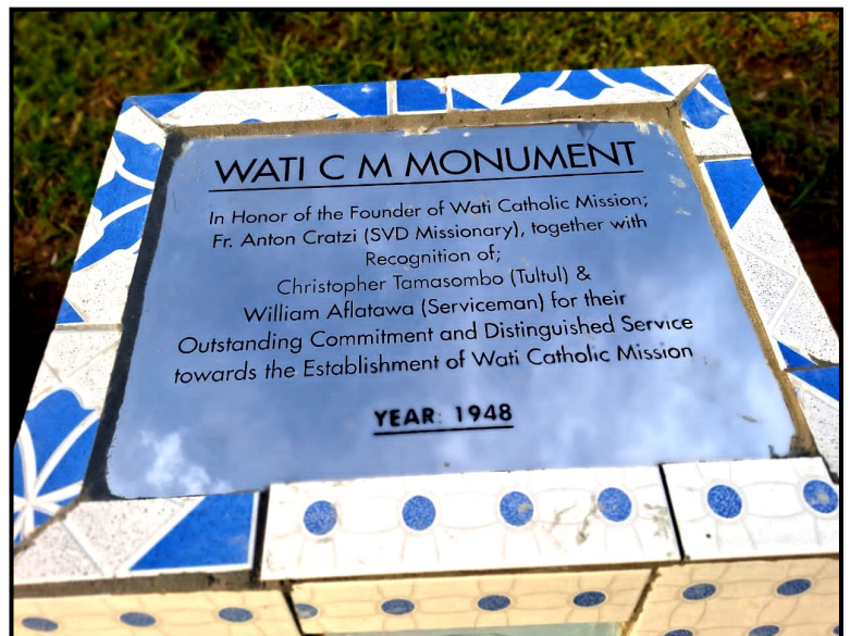
Completion stage of the Historical Monument for Wati Catholic Mission.