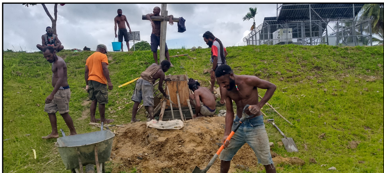
Construction of the Monument Foundation