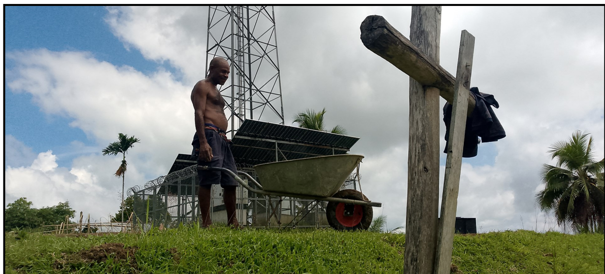
Construction of the Monument Foundation